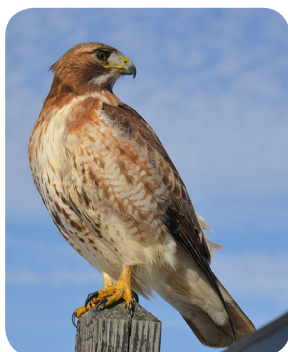
Red-tailed Hawk Buteo jamaicensis