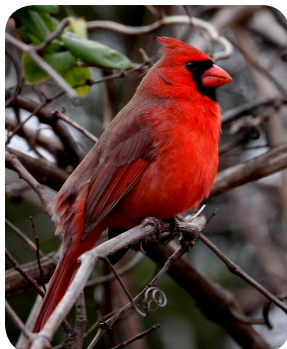
Northern Cardinal Cardinalis cardinalis