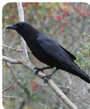
Fish Crow Corvus ossifragus