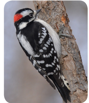
Downy Woodpecker Dryobates pubescens