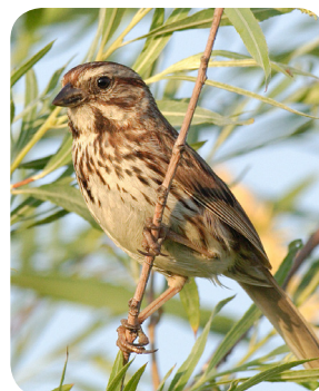
Song Sparrow Melospiza melodia