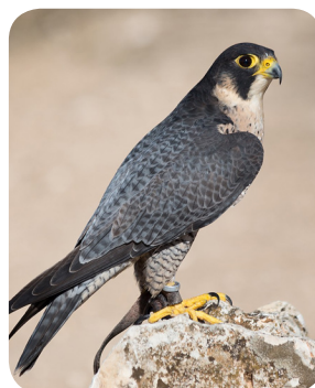
Peregrine Falcon Falco peregrinus

If you'd like to participate in a guided birdwatching walk through the park, visit https://www.thebattery.org/events/ or sign up for our newsletter. We offer walks in the winter, spring, and fall seasons in partnership with NY Audubon.