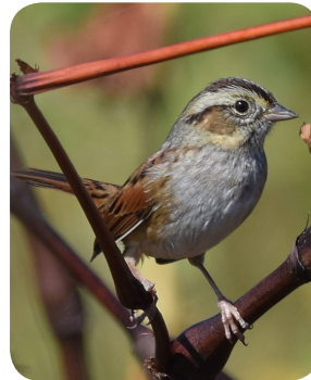
Swamp Sparrow Melospiza georgiana