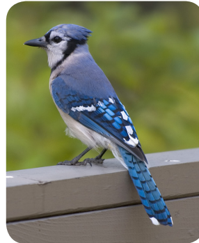
Blue Jay Cyanocitta cristata