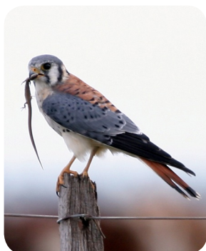
American Kestrel Falco sparverius