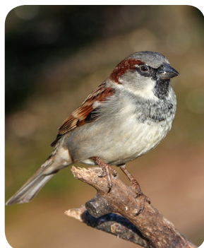
House Sparrow Passer domesticus