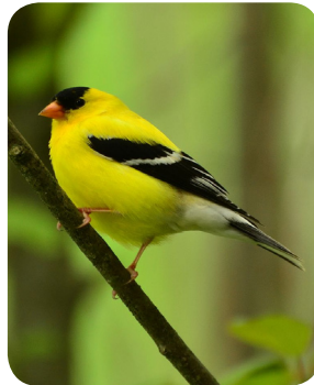
American Goldfinch Spinus tristis