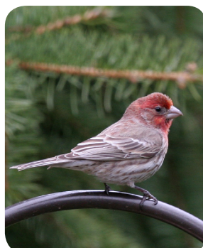
House Finch Haemorhous mexicanus