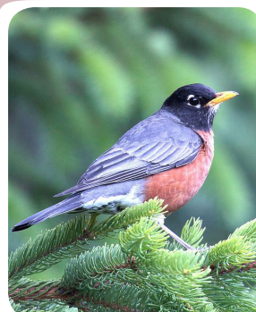
American Robin Turdus migratorius