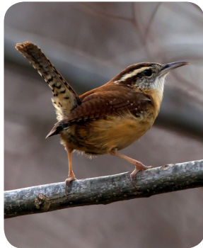
Carolina Wren Thryothorus ludovicianus