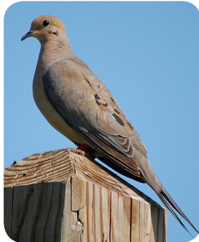
Mourning Dove Zenaida macroura