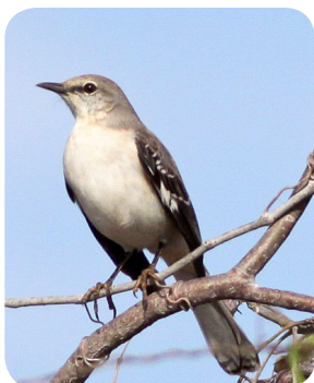
Northern Mockingbird Mimus polyglottos