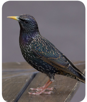
European Starling Sturnus vulgaris