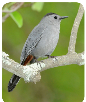
Gray Catbird Dumetella carolinensis