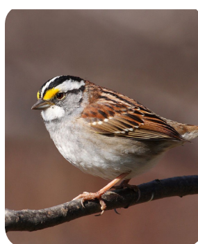
White-throated Sparrow Zonotrichia albicollis