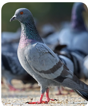
Rock Pigeon Columba livia