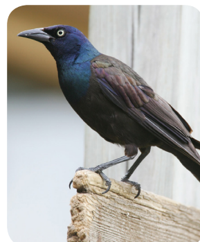
Common Grackle Quiscalus quiscula