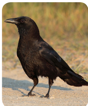
American Crow Corvus brachyrhynchos