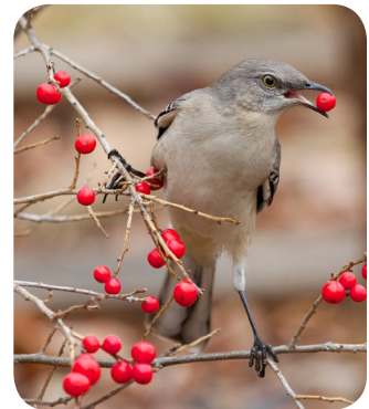
Birds eating winter berries