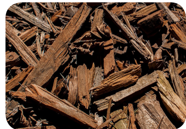
Wood mulch that is damp, soft, and easy to break

Please follow social distancing guidelines while in the park, to protect yourself and others.