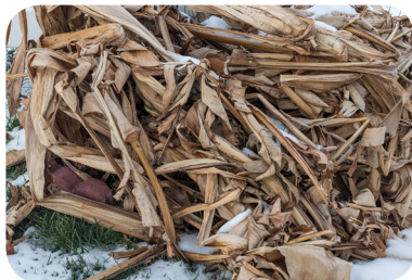
Dead, dried up plant stalks

Once the cold of winter hits, most of the plants on the farm die and start decomposing , turning into compost that will make the soil healthy for future plants. During this process, the plants get eaten by fungi , bacteria , and invertebrates . Can you find these signs of decomposition in the garden?