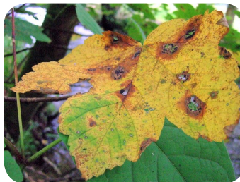
Leaves with spots made by fungi