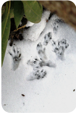
Animal tracks on the ground

Some animals migrate or hibernate to survive the cold winters, but many stay in the city and face the challenge of finding food and shelter to survive the harsh weather. Can you find the following evidence of animal activity?