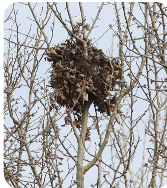
Squirrel's nest in a tree